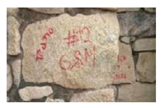
*Examples of graffiti on Machu Picchu